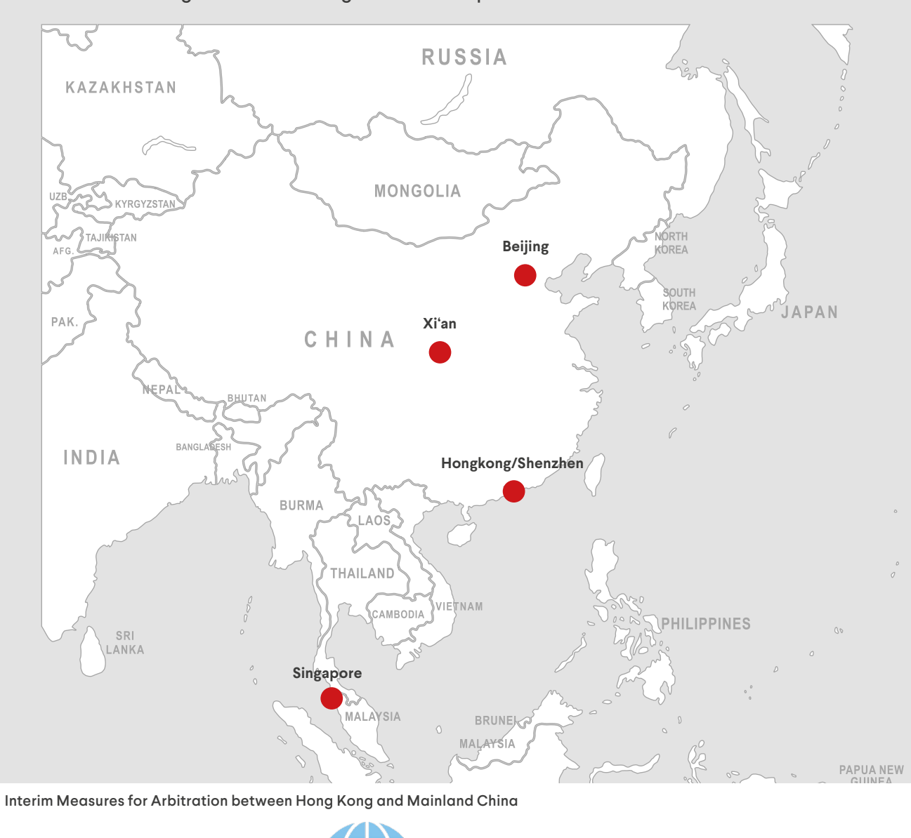
Figure 2: China's Integration with Dispute Resolution Mechanism in Asia