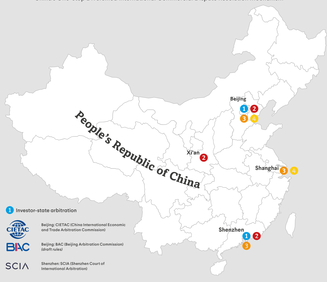
Figure 1: Chinese Dispute Resolution Network for Belt-and-Road Initiative (BRI) China's One-stop Diversified International Commercial Dispute Resolution Mechanism