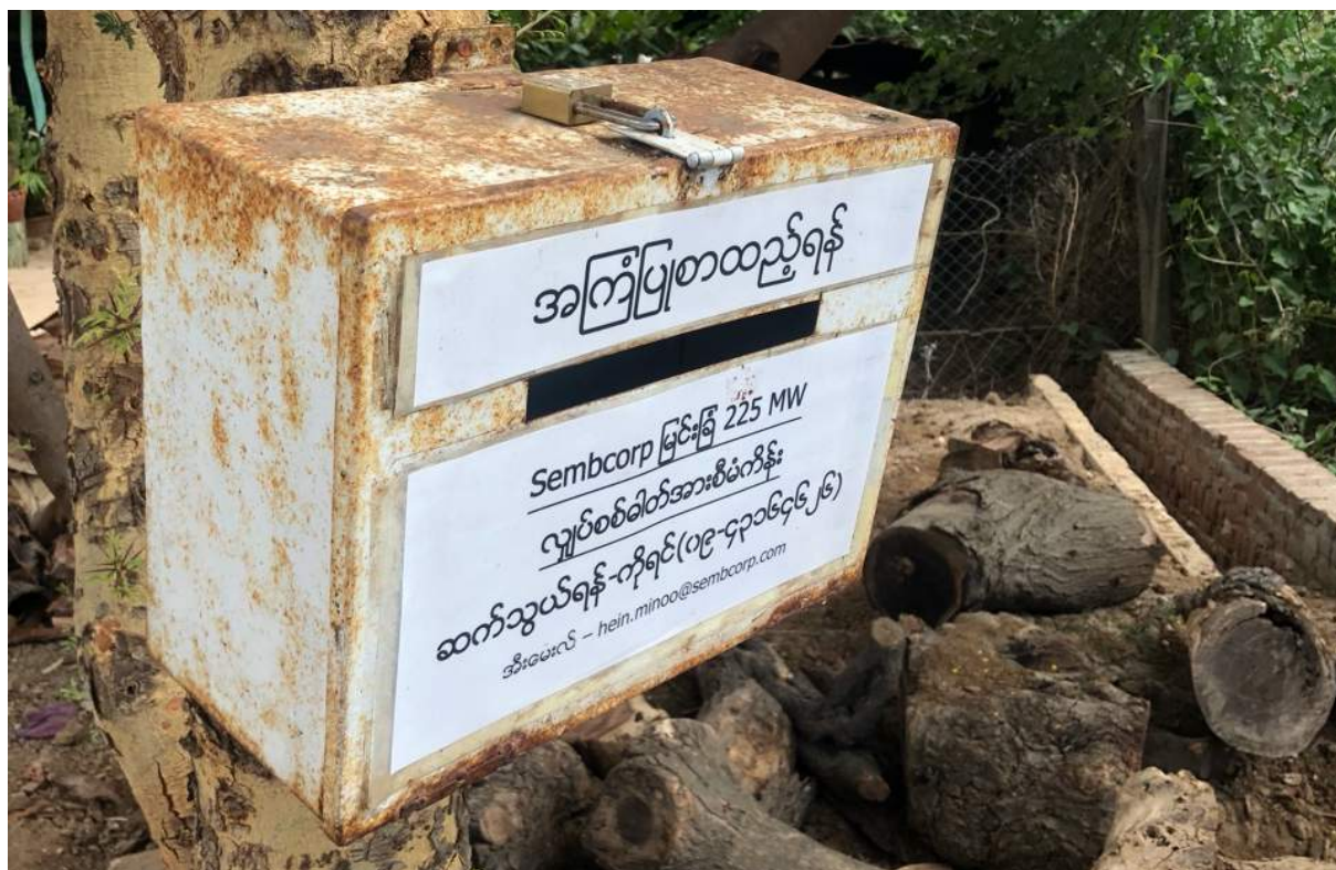
Complaints and suggestions box at the AIIB-funded Myingyan gas power project, Myanmar.

people and financial institutions. The more complicated policies are, the more expert knowledge is needed to file a complaint. Moreover, these bureaucratic processes require resources that affected people might not have. Therefore, affected people often seek support and advice from non-governmental organisations (NGOs), who can sometimes even provide legal expertise in crafting complaints. It has been shown statistically that complaints filed with the support of national (183 filed cases) and especially international (93 filed cases) NGOs are significantly more likely to be declared eligible compared to those filed without CSO involvement (167 filed cases). While 62% of complaints without NGO involvement were found eligible, this number increases to 80% in cases with support of a domestic NGO. Complaints filed with support of an international NGO were found eligible in 87% of cases. In addition, it was shown that complaints with the support of NGOs more often achieve a substantive phase in the complaint process. 61