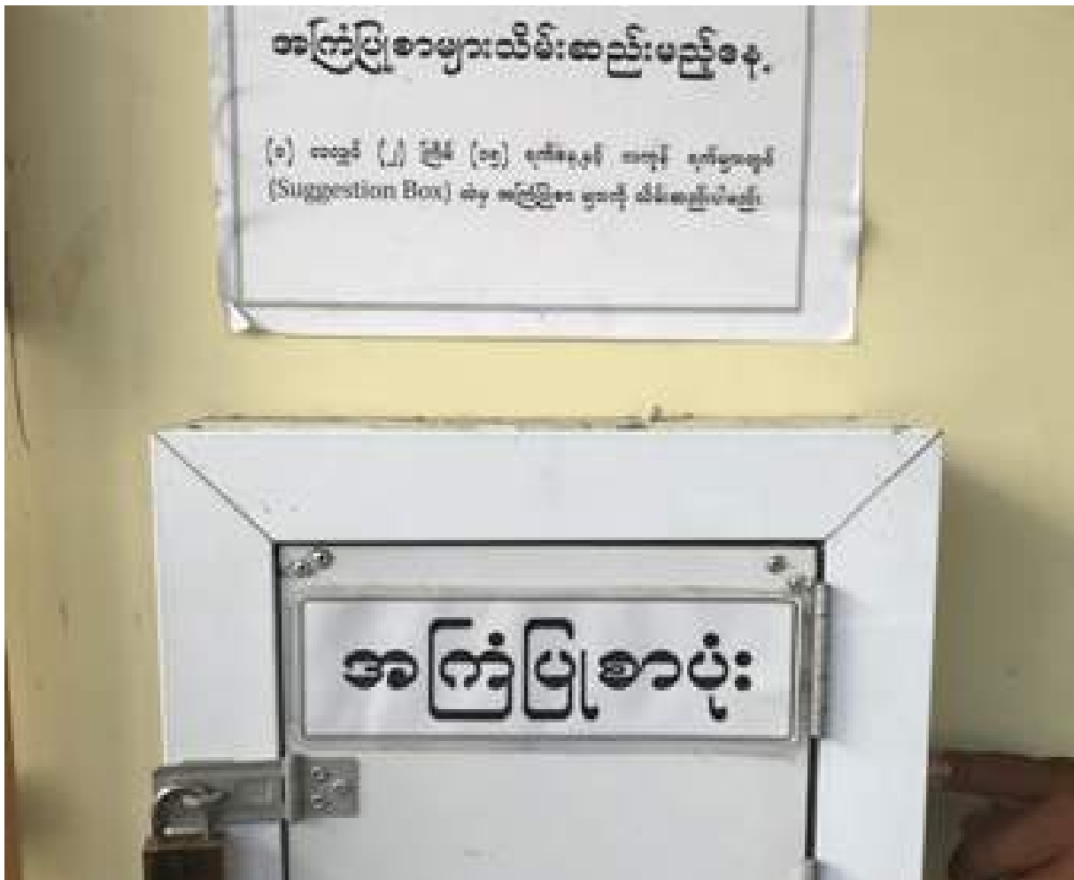
Complaints box at the AIIB-funded Shwe Taung cement plant and coal mine, Myanmar.

The PPM’s mandate is limited to reviewing compliance with the AIIB’s ESP, and the PPM explicitly cannot investigate borrower and company errors (PPM Policy 5.2.1). Complaints related to policies other than the ESP